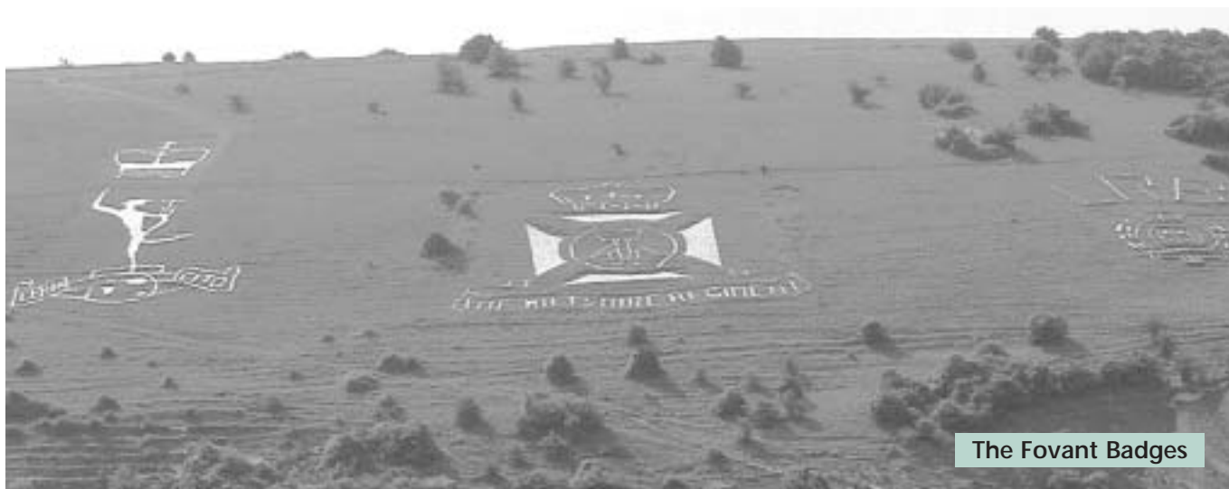
The Fovant Badges