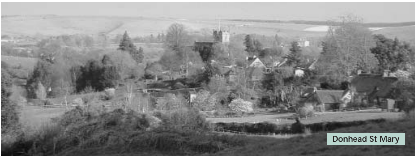
Donhead St Mary